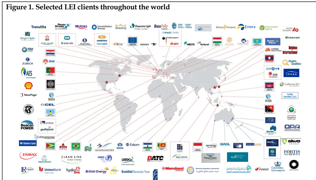
Figure 1. Selected LEI clients throughout the world

The following attributes make LEI unique: